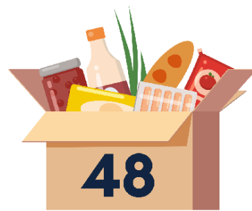
- Collection Boxes -