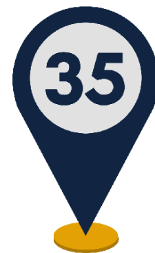
- Participating Locations -