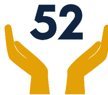
- Local Volunteers -

The Arc is delighted to highlight the impact that all of these community partners have made in their local communities this year. We are especially thrilled about these outcomes, and we take great pride in achieving our goals inclusively with the assistance of people with disabilities.