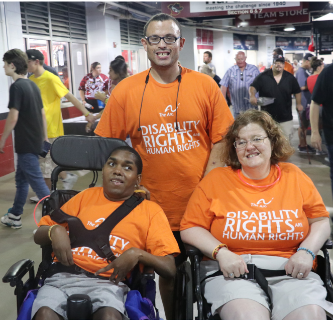
Individuals enjoy an evening of pride and awareness at the Disability Awareness Night with the Quad City River Bandits at Modern Woodmen Park in Davenport, IA.

Help us highlight the many ways in which people with and without disabilities come together to form strong, diverse communities at Disability Awareness Night.