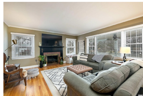
Images above from Zillow.com are of the new Watch Hill location.