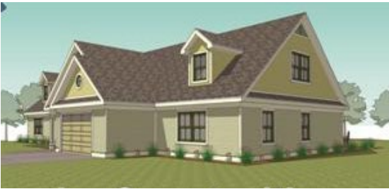
Artists rendition of what the sixth home in Moline will look like when completed.

work clearing debris for construction of a new home that will house eight individuals with disabilities. The home will look similar to the five homes constructed in 2015 and 2016 and is a direct result of Phase II of the capital campaign completed just last year. “This