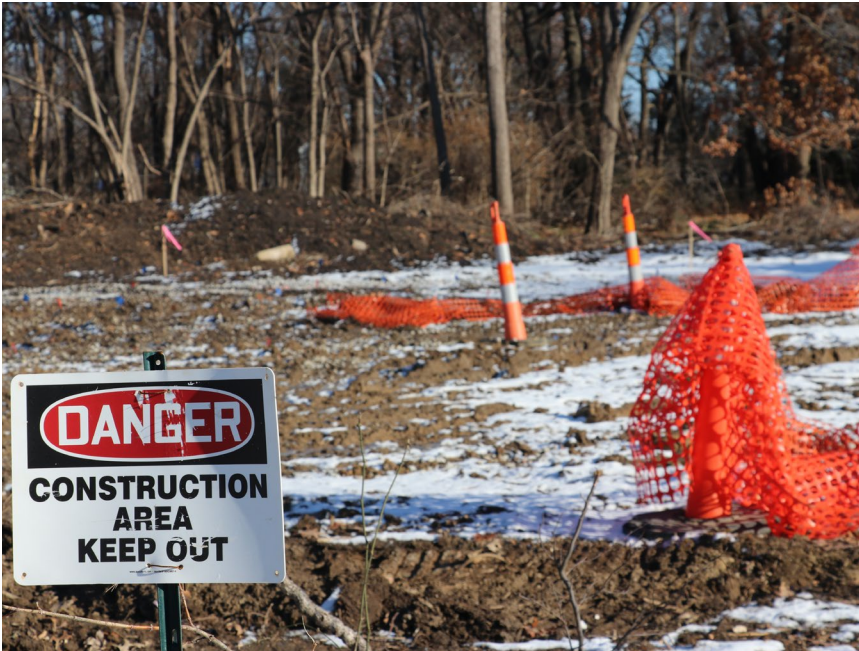
A construction sign warns of danger along 7th Street in Moline.

Along a quiet side street in Rock Island there is a small bungalow that for years served as a residential home for individuals with disabilities. Along with the sounds of hammer and drill are the sounds of birds chirping, a kind of prelude to the peaceful setting the home will return to once construction is completed.