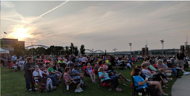
Participants enjoy a beautiful evening along the Mississippi River at Schweibert Park. The Arc sponsored Thursday Night groove because it affords an inclusive experience that is enjoyed by all.