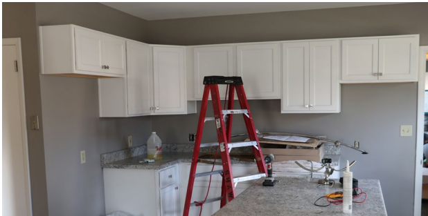
The finishing touches are being made to 2930 that will soon house two individual “apartments” for maximum independent living.

work clearing debris for construction of a new home that will house eight individuals with disabilities. The home will look similar to the five homes constructed in 2015 and 2016 and is a direct result of Phase II of the capital campaign completed just last year. “This